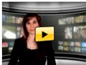
How to Invest in Banks in 2012