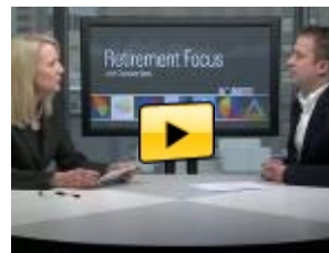
The Bucket Approach to Retirement Portfolio