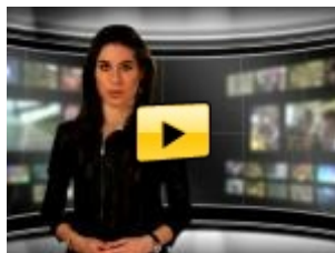
When to Invest in Facebook's IPO